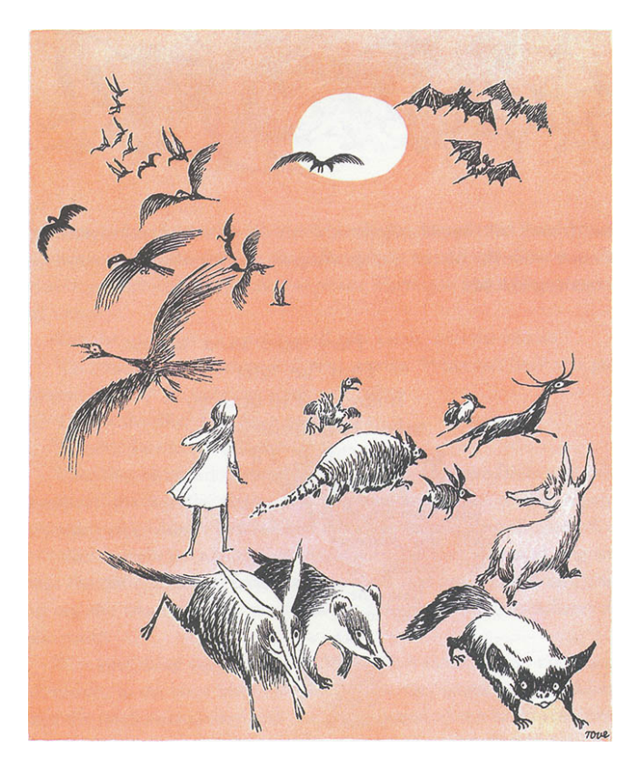
Figure 4. Carroll, Lewis. Alice's Adventures in Wonderland. III. Tove Jansson. Stockholm: Bonnier, 1966 © Oy Moomin Characters Ltd, p. 28 in the English edition.