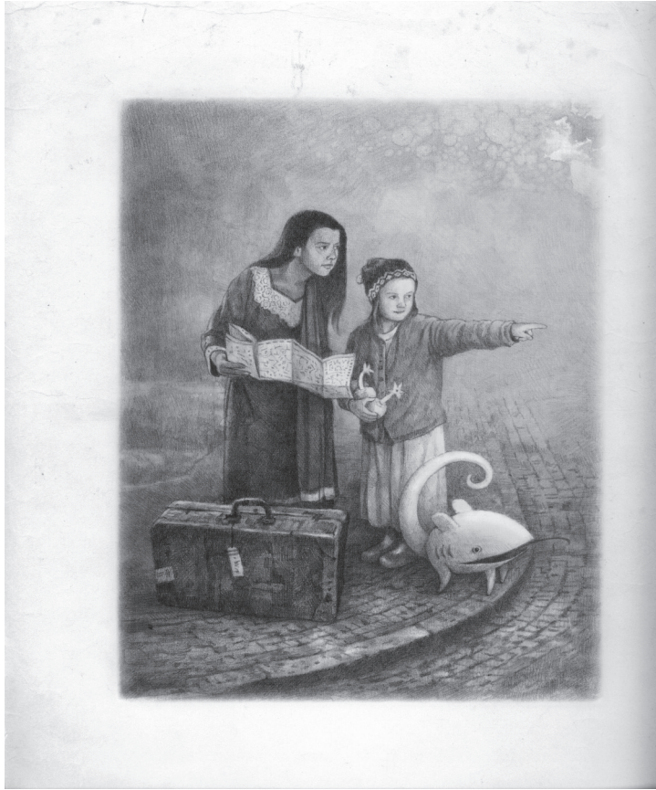
Figure 2 The arrival. Images reproduced with permission from The arrival by Shaun Tan, Lothian Children's Books, an imprint of Hachette Australia, 2006.

diverse elements into account. Thus, they invite complex styles of reading which acknowledge the positionality of readers. The post-colonial theorist Gayatri Spivak was the first scholar to call for the cultivation of "transnational literacy", proposing this concept in her essay "Teaching for the times", where she draws upon the liberatory agendas of Paolo Freire and the Subaltern Studies collective, a group of South Asian scholars who foreground the knowledge and perspectives of peoples dispossessed or subjugated by colonialism, social inequality and discrimination. Spivak invites her readers to "re-think our agency" (Spivak 1992, 6) as Western scholars, arguing that we should be ready to unsettle our habitual ways of thinking and reading by taking on the perspectives of others. This is not as