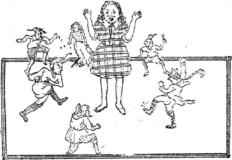
Figure 4. Shufang's dream ( Mugu gushi 8).

ners, indicating that there has been a shift in the power dynamics of mission presses in the early twentieth century. The members of the Committee evaluate the manuscript initially then send it to the relevant Sub-Committee, one of which is the "Women's and Children's Book" committee. They ask the following questions: "Would this if printed be a valuable addition to Christian Literature? Do they agree that it has a place in the Literature Programme which has been prepared? Is the style acceptable and suitable for the class of reader for which it is written? If printed, will it sell or be more likely to remain on the shelves of the godown gathering dust as the months roll on?" (MacGillivray 76). The article not only makes transparent the selection criteria used to evaluate a manuscript, it also illuminates the publication process. After discussing the questions listed above, the Committee gives the manuscript to two members for further scrutiny. If they are satisfied with the content, it goes back to the Publications Committee. If not, they will return it to the author. The Publications Committee decides on the total number of words, font type, paper, the size and layout of the book, chooses illustrations, and sets the retail price. Then the contract goes to the author. For