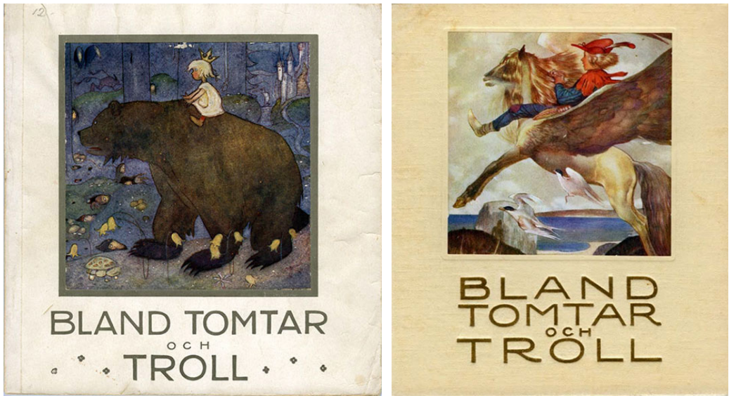
Fig. 1. Bland Tomtar och Troll cover illustrations from 1919 and 1926.

(1920–1926), which reveal a marked influence of American illustrators such as Howard Pyle (see fig. 1).