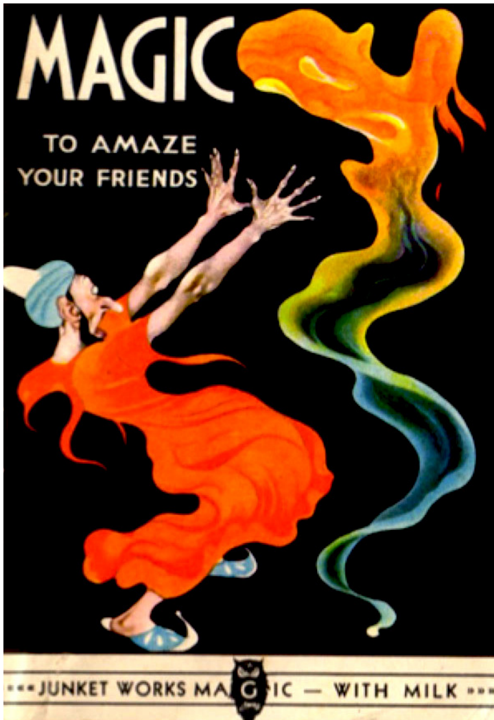
Fig. 5. 1931 Junket Ad

fig. 5) accompanied by instructions for magic tricks with which children can “amaze” their friends. The mix of the visual allure with the illusionist’s secrets enlists children who, accompanying their mothers to the market, can then act as agents in the consumerist project. On the inside pages of the booklet, children are encouraged to “keep fit with Junket” by checking their weight and height against standardized charts, subsuming children into a self-regulatory body regimen, while the extraneous dessert mix purports to be nutritious and beneficial. Tenggren’s artwork transforms the ordinary into the fantastic, while symbolically (magically) dessert is transformed into