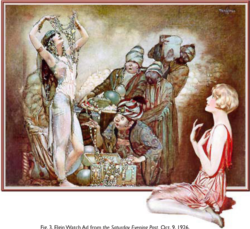
Fig. 3. Elgin Watch Ad from the Saturday Evening Post , Oct. 9, 1926.

look over her shoulder. The modern girl sits looking in (and back) upon the bejeweled woman in the scene with obvious amazement, pleasure, and desire even as she has eschewed the constricting “style of Scheherazade” (Charles-Roux 125) and opted for the freedom of the flapper’s dress. Visually Tenggren has effected what Edward Fry has referred to as “cubist reflexivity” – the dialectic between past and present forms of representation, and has called attention to the conventions of both (296–298).