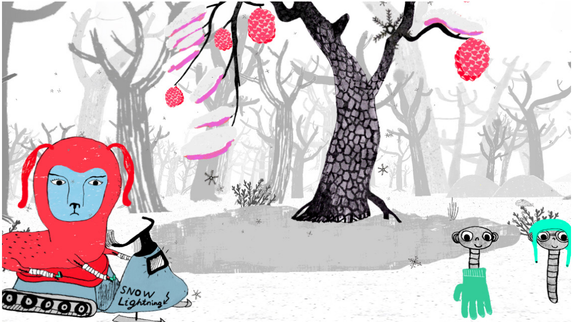
Illustration 3. Thit Maya needs you to shake the pine cones down from the tree. © Step In Books, 2015.

there are five different stories to choose between. The stories are similar, and relate the trouble this particular character is in and the problems they need help solving. For each story, the narrator presents the reader with a background story for the specific character. At the end of each story, you are addressed in second-person and encouraged to help in a certain way. For instance, in the case of Thit Maya, we learn that she and her friends love pine cones, but when Thit Maya breaks all of her four legs falling on the ice and no longer is able to shake down pine cones from the pine trees, they are all in danger of starving. Therefore, Thit Maya needs you to help her get pine cones down from a tree, which is relayed by the narrator in a direct address to the reader: "Can you help Thit Maya and her friends shake the pine tree?" (see ill. 3). Then, he continues by giving instructions: "Remember what she said: First the snow has to be shaken off, and then the pinecones have to be shaken to the ground."