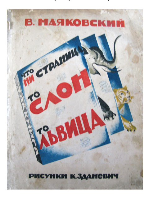
Picture 2. Illustration by Kirill Zdanevich for Vladimir Mayakovsky's Chto ni stranitsa, – to slon, to l'vitsa (Not a Page without an Elephant or a Lioness, 1928). Cotsen Children's Library, Department of Special Collections, Princeton University Library.

Picture 1. Cover illustration by Kirill Zdanevich for Vladimir Mayakovsky's Chto ni stranitsa , — to slon, to l'vitsa (Not a Page without an Elephant or a Lioness, 1928). Cotsen Children's Library, Department of Special Collections, Princeton University Library.