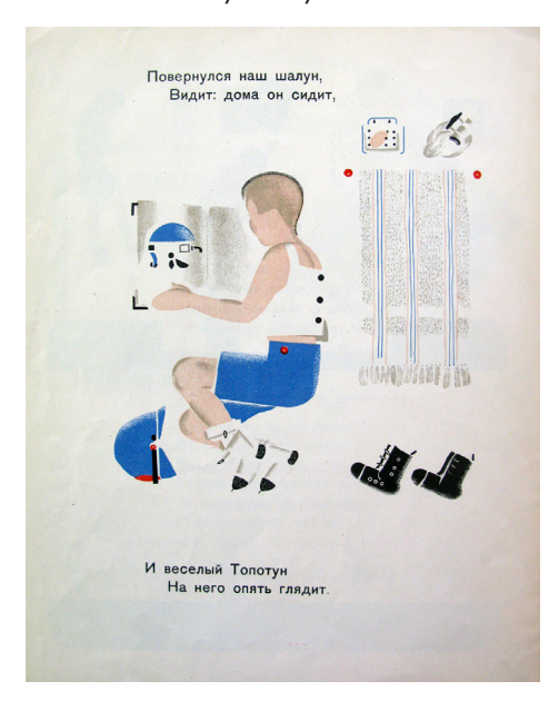
Picture 8. Illustration by Mikhail Tsekhanovsky for Ilya Ionov's Topotun i knizhka (Topotun and the Book , 1926). Cotsen Children's Library, Department of Special Collections, Princeton University Library.

Picture 7. Illustration by Mikhail Tsekhanovsky for Ilya Ionov's Topotun i knizhka (Topotun i knizhka 1926). Cotsen Children's Library, Department of Special Collections, Princeton University Library.