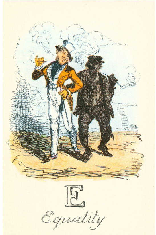
Picture 1. From George Cruikshank, A Comic Alphabet . Pentonville, 1836. Note the various ways this text can be interpreted, either as sympathetic to members of the lower class, or as mocking them.

-class person eating out or the limited options available to those without economic resources? In the latter, is he ridiculing the idea that these two figures should be considered equal, or is he illuminating conditions that make real equality between individuals impossible? In either case, the text evokes not just children (by virtue of its genre) but also members of the working class – that is, politically subordinate people, who are often associated with children.