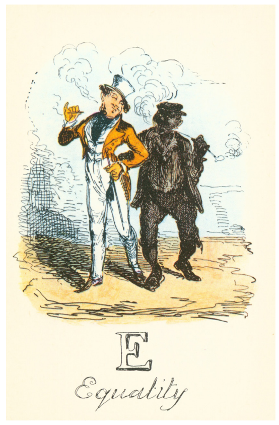
Picture 1. From George Cruikshank, A Comic Alphabet. Pentonville, 1836. Note the various ways this text can be interpreted, either as sympathetic to members of the lower class, or as mocking them.

-class person eating out or the limited options available to those without economic resources? In the latter, is he ridiculing the idea that these two figures should be considered equal, or is he illuminating conditions that make real equality between individuals impossible? In either case, the text evokes not just children (by virtue of its genre) but also members of the working class – that is, politically subordinate people, who are often associated with children.