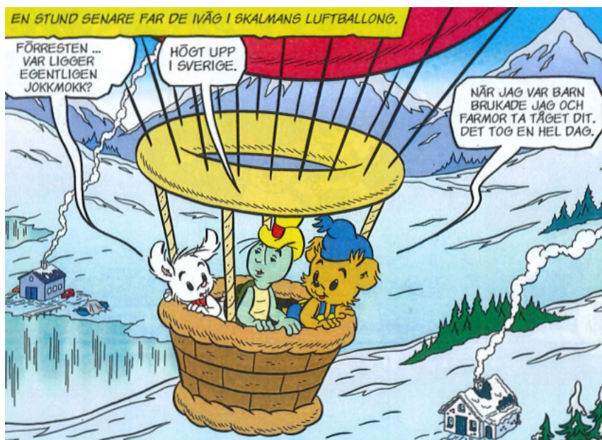
Figure 3. "Bamse möter Stallo" (2021), p. 4. © Egmont Publishing, Malmö. By permission.

tionalised permanence of racism and Swedishness as property expressed in the novel. The verbal communication portrays, in a rather matter-of-fact manner, the steps in the process leading to the removal of the Sámi, starting with one settler encroaching the Sámi man's land, followed by another. The panels enhance and complement the verbal narrative (cf. Nikolajeva and Scott), showing first one Sámi versus one settler, then one Sámi versus two settlers.