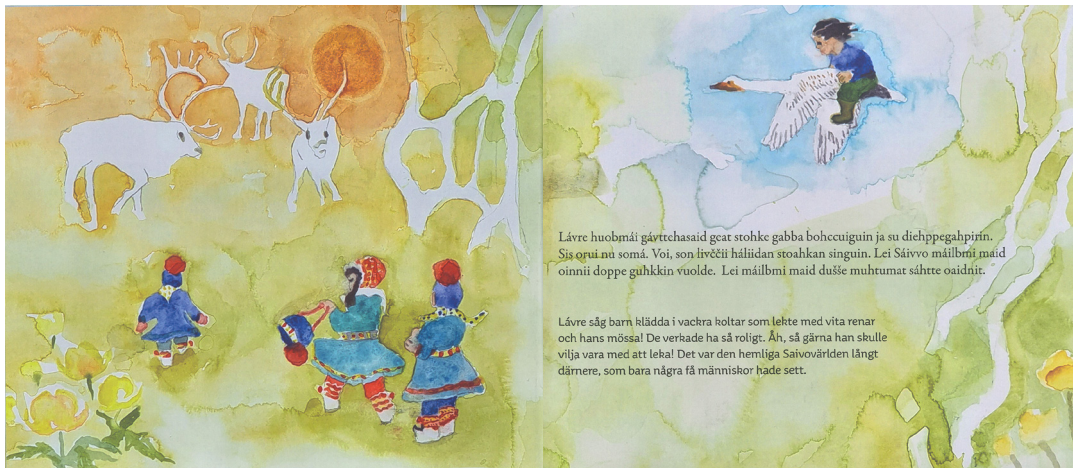
Figure 5. Lilli, Lávre ja Sáivoálbmot/Lilli, Lávre och Saivofolket (2021). © Elin Marakatt (text), Anita Midbjer (illustration), by permission from author and illustrator.

Sáivu is part of the fabric of the children’s lives. The family does not just value the fen for the berries they can pick, but also because it spiritually connects the living with their ancestors and Sáivu. Helping children understand these connections undermines notions of land ownership, and thus aligns with the tenet of critical race theory regarding questioning the naturalisation of norms, in which Swedishness is the norm and Sáminess is the marked category (cf. Kokkola and Van den Bossche; Flanagan).